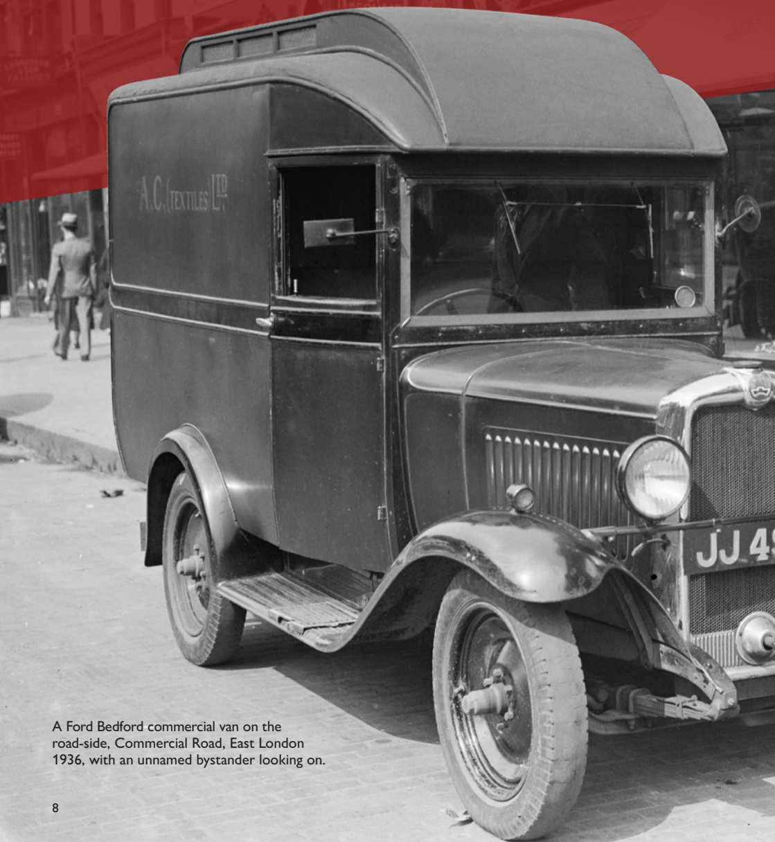
A Ford Bedford commercial van on the road-side, Commercial Road, East London 1936, with an unnamed bystander looking on.

“Space between the far surface of the lens and the image plane, when the lens is focused at infinity.” SWPP, 2021