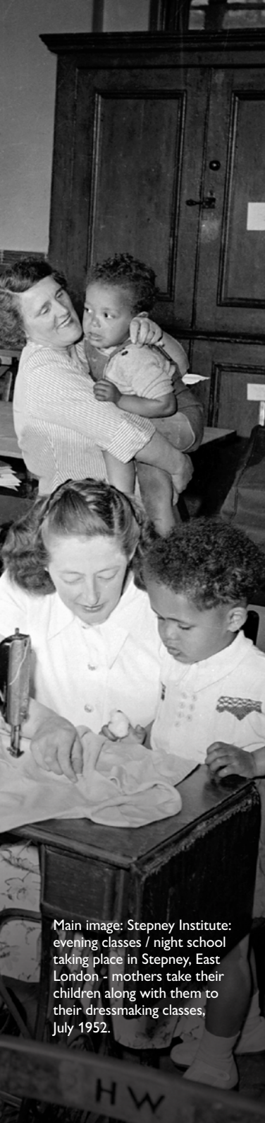
Main image: Stepney Institute: evening classes / night school taking place in Stepney, East London - mothers take their children along with them to their dressmaking classes, July 1952.

Yes, these are my children, England. We're sailing home to you, England.