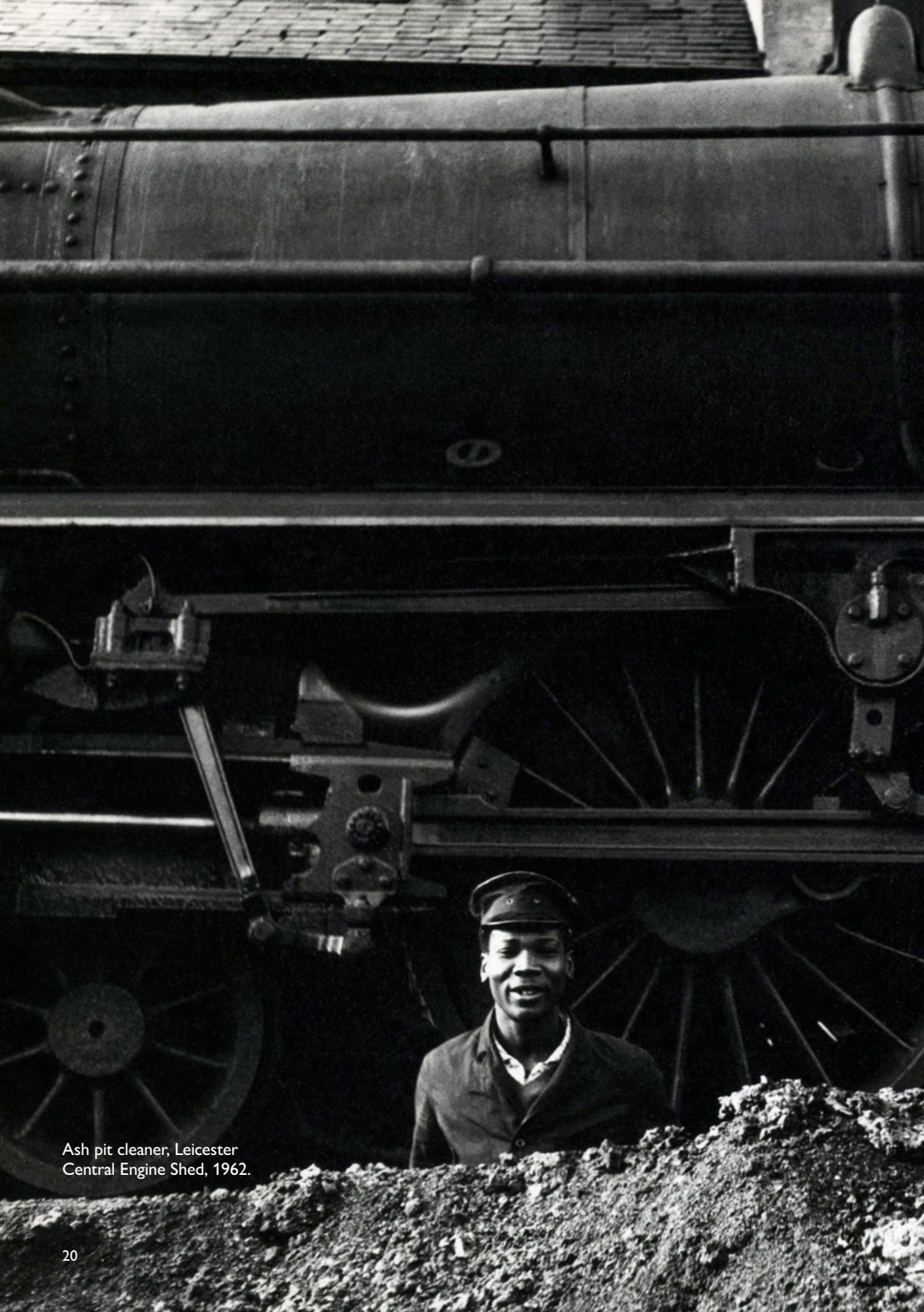
Ash pit cleaner, Leicester Central Engine Shed, 1962.