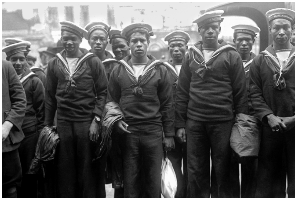
Above: British Navy, WW1, Fleet Auxiliary arm, July 1917. Cover: 14th October 1938, crowds of children cheering Queen Mary as she opened a new extension to Lambeth Town Hall, Brixton, London.

This exhibition asks us to take another look at the past, the images gently reminding us that our view of history is often the upshot of the stories we were never told just as