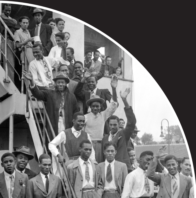
HMT Empire Windrush, Tilbury, a crowd of arrivals on the ship, 22nd June 1948